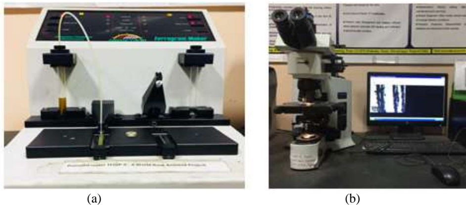
Fig. 2 (a) Dual Slide Ferrogram Maker, (b) Bi-chromatic Microscope