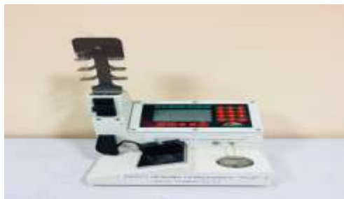
Fig. 1 Direct Reading Ferrography

The experimentation was carried out on new gear pair and it was run till 800hrs, oil samples were collected after 200hrs of running. The lubricant is a powerful source of information on machine condition since, if the oil deteriorates, then so too does the machine condition [9]. Quantitative analysis of oil sample was carried out using direct reading ferrography (DR-5) as shown in figure 1. Qualitative ferrographic analysis of lubricant was carried out using dual slide ferrogram maker and Olympus BX52, bi-chromatic microscope as shown in figure 2. In Analytical ferrography, wear particles are separated from the lubricated oil samples by magnetic field. Lubricated oil sample is diluted using fixture oil for proper precipitation and adhesion of wear particles on glass slide [10]. This sample flows through a particularly designed glass slide known as ferrogram slide with dimensions 60x25mm. Due to magnetic field larger particles get settled at the entrance point, after the particles get deposited on ferrogram slide fixture oil flows through it to remove excess oil from the slide [11]. This Ferrogram slide was prepared on dual slide ferrogram maker which was then studied under bi-chromatic microscope.