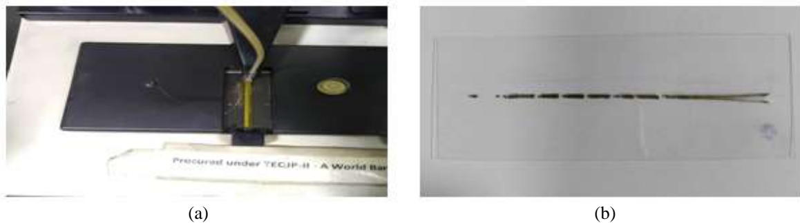
Fig. 3 (a) Slide Being prepared, (b) Ferrogram Slide

Preparation of ferrogram slide is shown in figure 3. The slide was prepared for oil sample collected after 800 hrs of running. After preparation of slide, it was studied under bi-chromatic microscope for shape identification of wear particles [13].